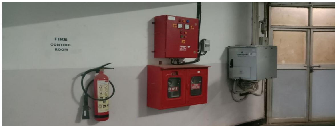
(Fig- Bolangir Campus)