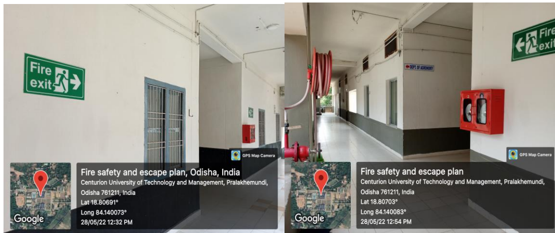
(Fig- Paralakhemundi Campus)