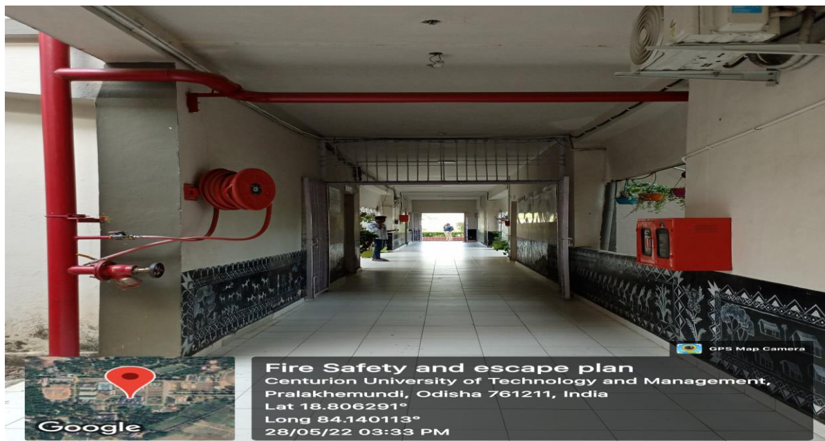
(Fig- Paralakhemundi Campus)